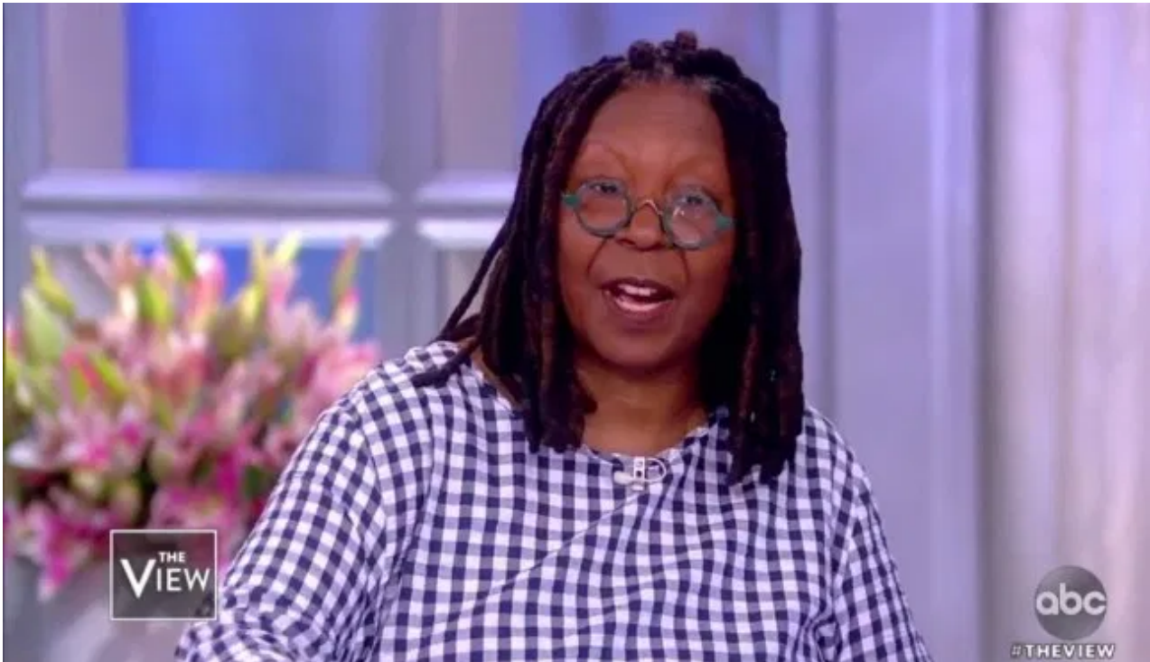
Whoopi Goldberg says she blames herself for the breakdown of her three marriages

Whoopi Goldberg says she is to blame for her marriages not working out because she doesn't think she was ever in love.